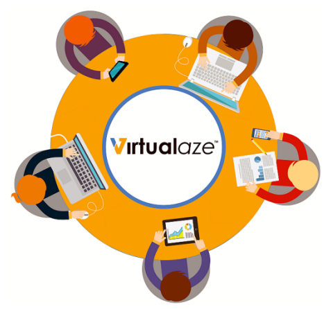
Virtual aze Media-Corner PCs

Virtualaze UnifyPlus is enabled via Windows and browser based HTML5 access clients running through a dedicated Web/Cloud Gateway server. The solution even gives the administrator the option to reuse or integrate existing PCs, tablets, Chromebooks, Zero/Thin Clients, Pi and laptops. By default, Virtualaze is 'Cloud-ready' and even pupils, teachers, administrators or other users could work on the specific school applications from home. A 128 Bit SSL encryption protects the data traffic between the Application Launcher (Access client) and the Virtualaze Application Server infrastructure.